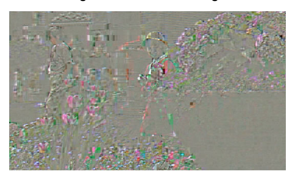
Figure 4. Residual Image

single frame, as such the prediction accuracy and subsequent compression efficiency does not deteriorate with motion as it would with long GOP.