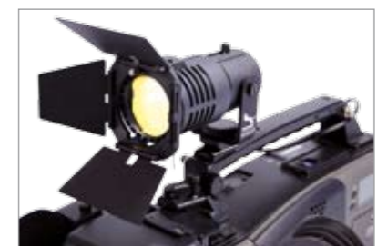
ROMY 75 with 4 leaf barndoor