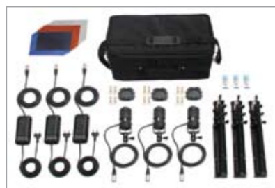
ROMY 100 Set Light | code no. 155808

As the smallest and lightest location light kit on the market, its three 100 W lights provide the right illumination for small sets. It's a fast and inexpensive solution for lighting interviews, close-ups and pack shots. The 4 leaf barndoor and three provided gel filters are just what you need for small studio productions.