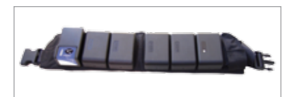
code no. 139868