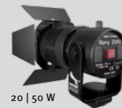
20 | 50 W